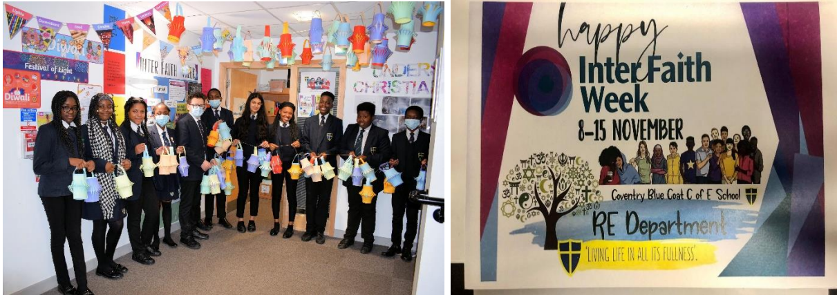
Students at Blue Coat School during Inter Faith Week 2020