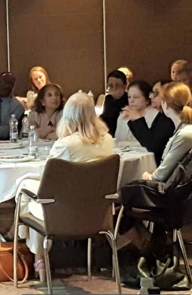
Pan-Berkshire joint SACRE conference - September 2017