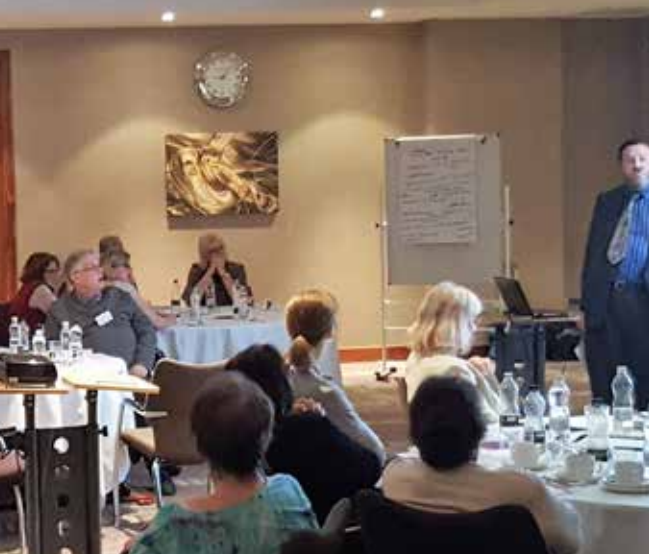
Pan-Berkshire joint SACRE conference - September 2017