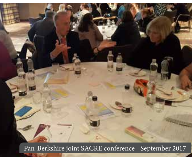
Pan-Berkshire joint SACRE conference - September 2017