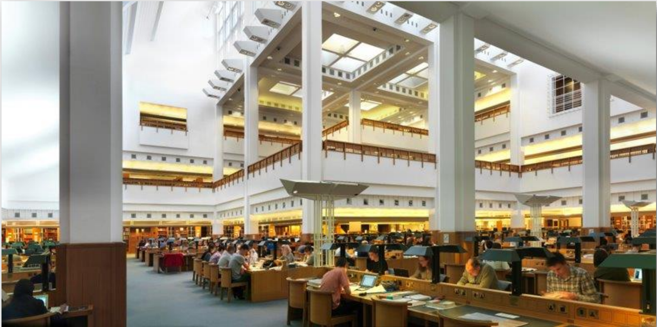
The British Library, St Pancras, Humanities 1 reading room