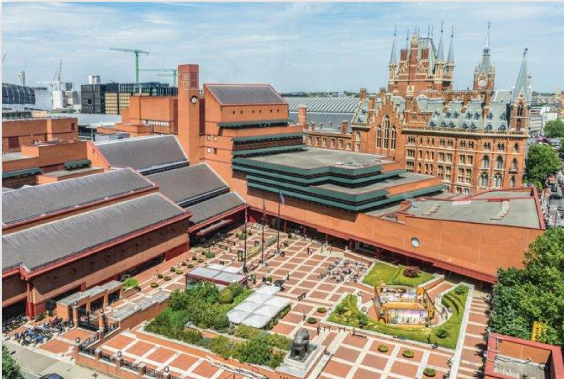
The British Library, St Pancras