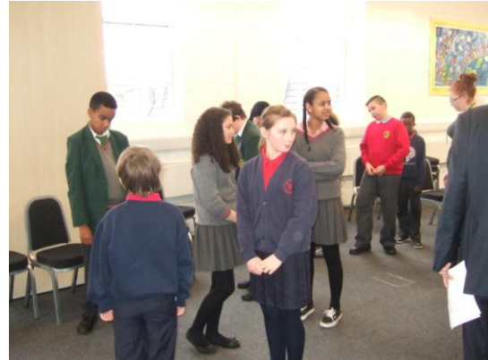
'I feel left out'