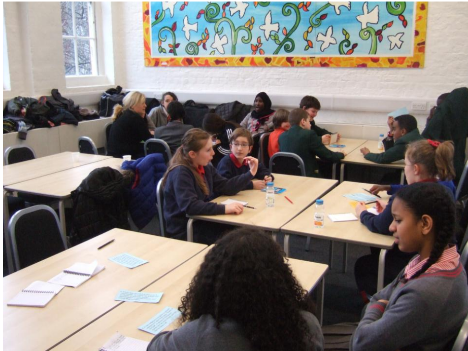
We looked at several different cards, each giving a 'difficult scenario'

We began to think more deeply about some 'difficult issues'. Some of these we had raised at our last session.