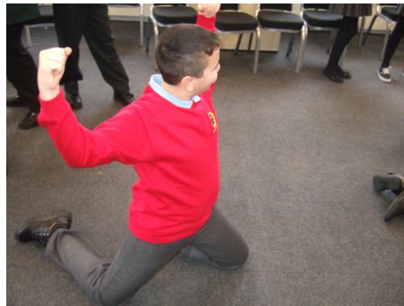
'I am a champion!'