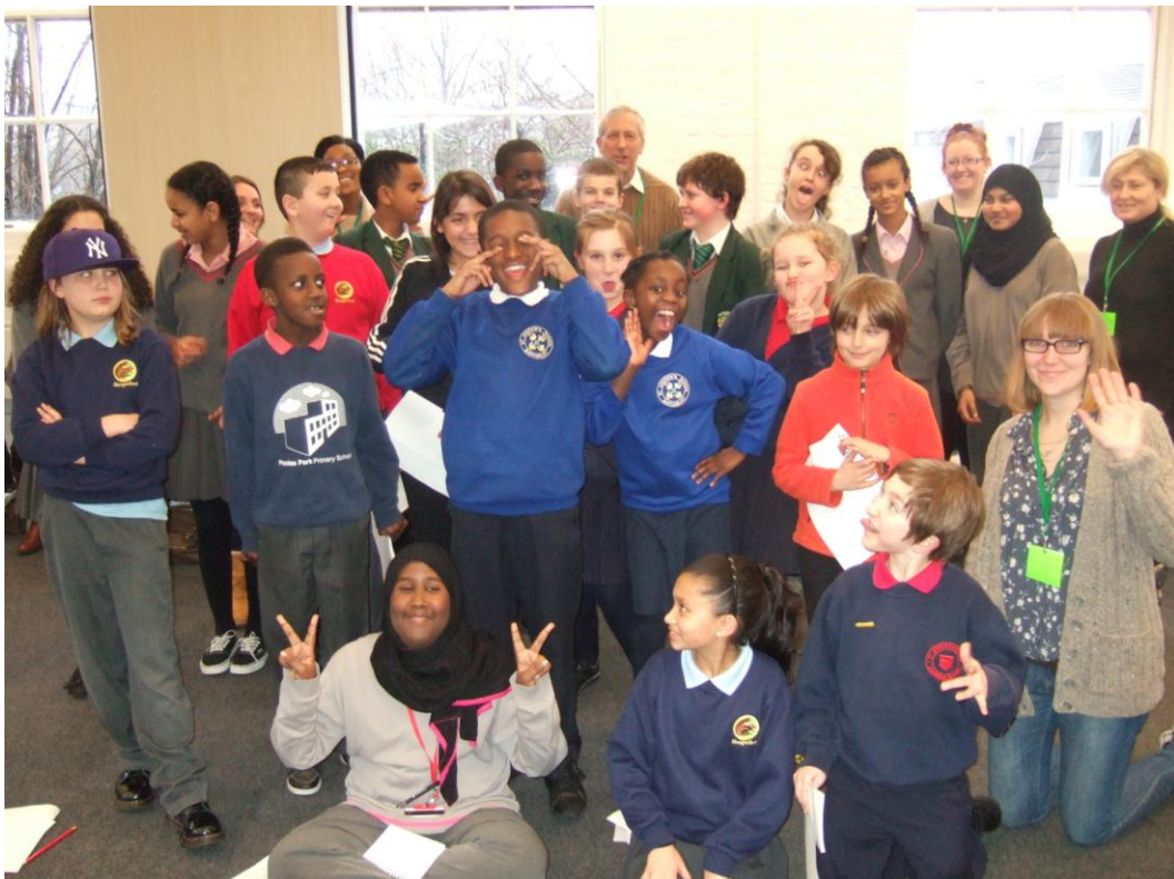
Goodbye and see you next term!

We had a lot of fun and the children and young people again made really considered, insightful and thought-provoking comments. Importantly they also fulfilled the aims of the day by making informed decisions that promise much for our session next term. There we will be preparing presentations for the young people to take to the SACRE AGM.