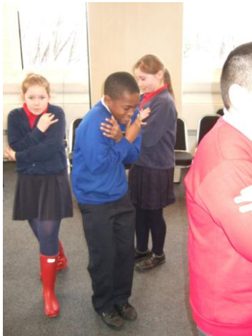
'I feel cold'

To work up an appetite the young people presented some drama 'freeze-frames'. They then played a game that got them into the groups they would work in after lunch.