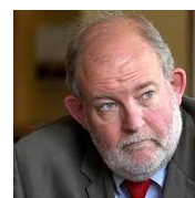
Rt Hon. Charles Clarke