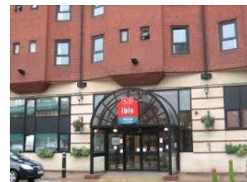
Ibis Hotel Birmingham Centre 21 Ladywell Walk, Arcadian Centre, Birmingham B5 4ST (5 minute walk from New Street Station)